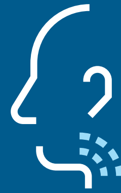
Xanuun cunaha ah

Waa inaad guriga joogtaa hadaadan hubin inaad jiran tahay. Naftaada karantiil oo isu diyaari in lagu baaro. Waa inaad guriga joogtaa ilaa inta aad waayayso calaamadaha oo dhan muddo gaadhaysa 48 saacadood.